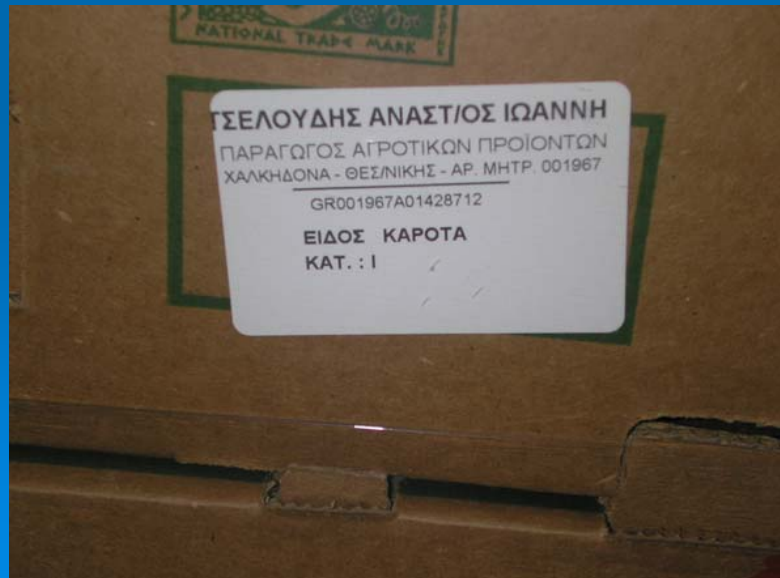
•Codes and Labels required by Greek Government and UE