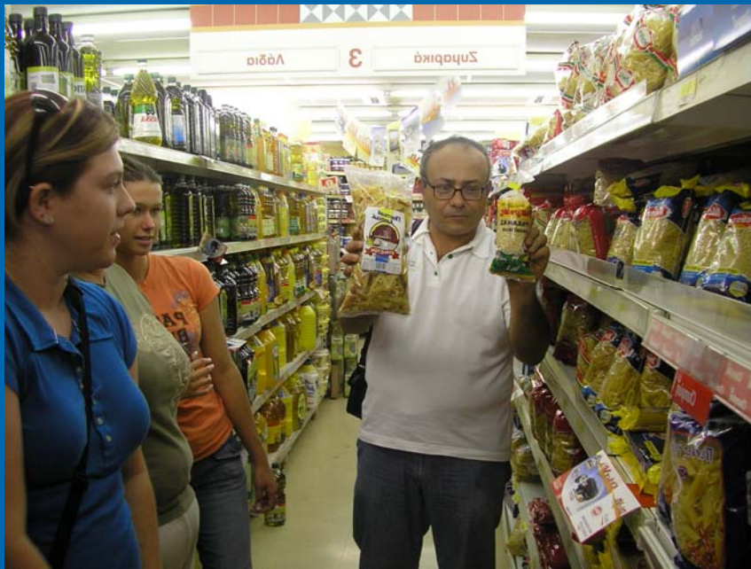
•Pasta made in Greece; the Durum Wheat in Greek pasta