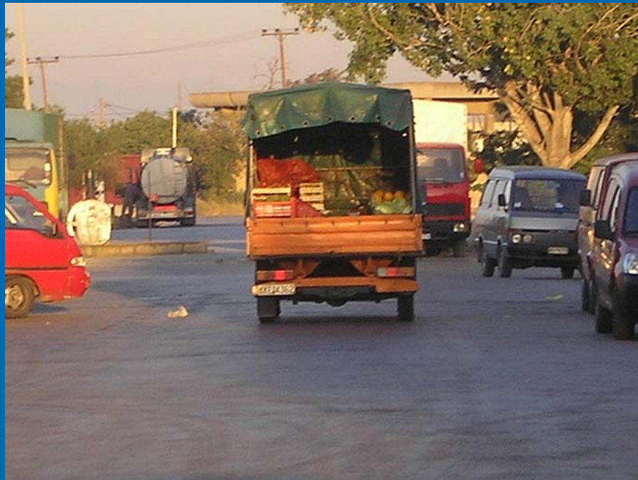
• Fresh vegetables and fruits transported to the grocery stores, Thessaloniki