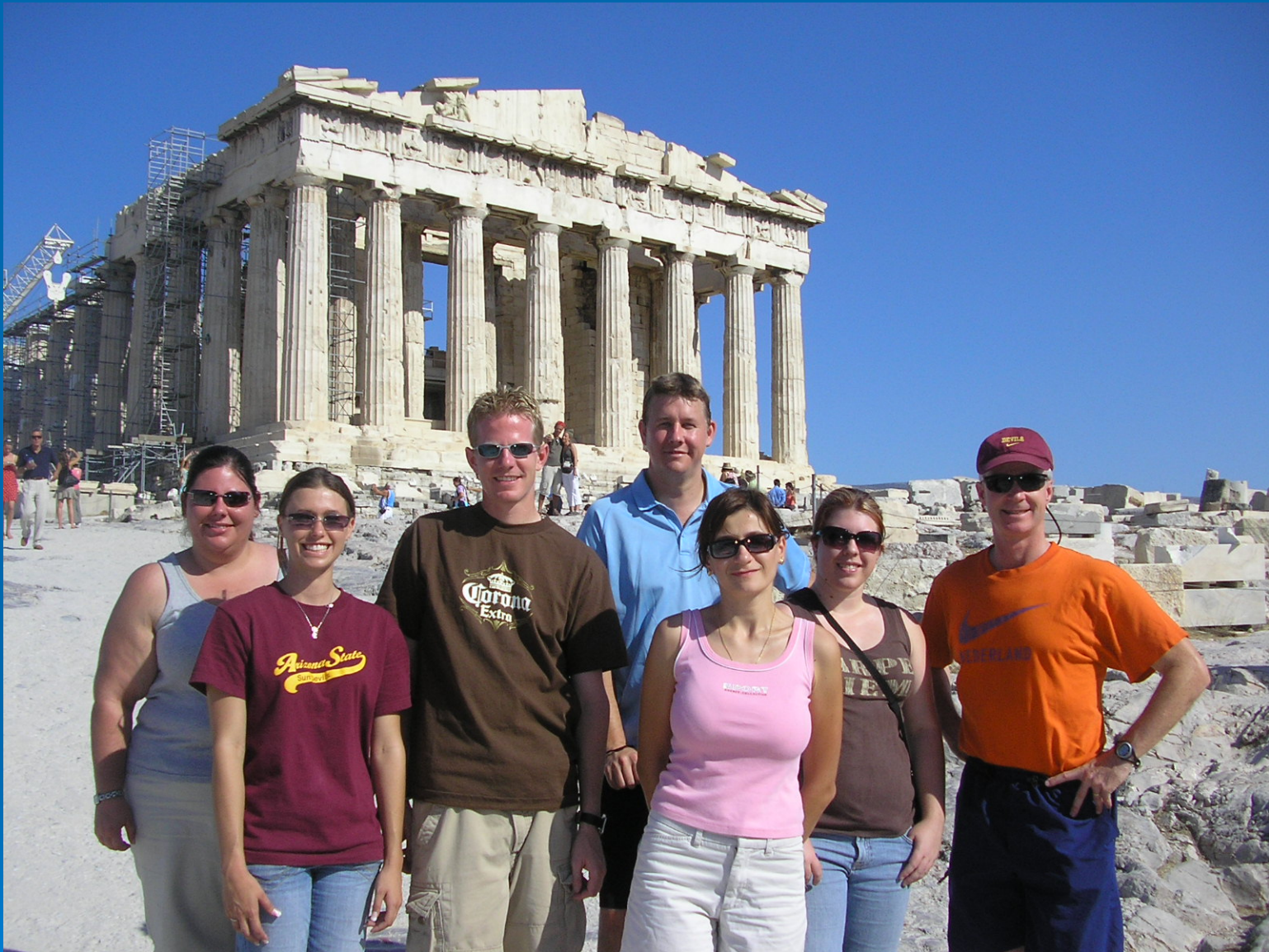
•The ASU Team at the Acropolis