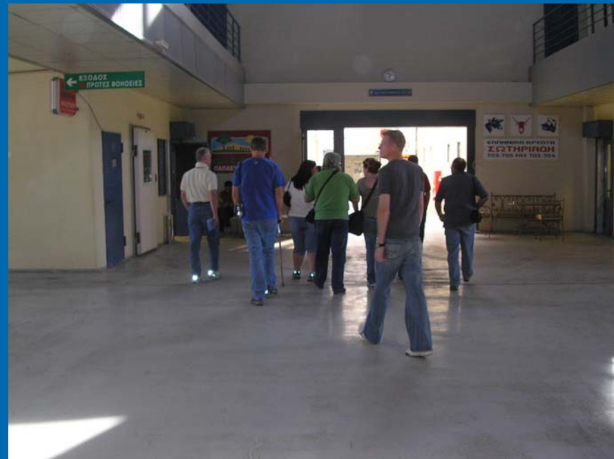
•The ASU team at the Meat Market