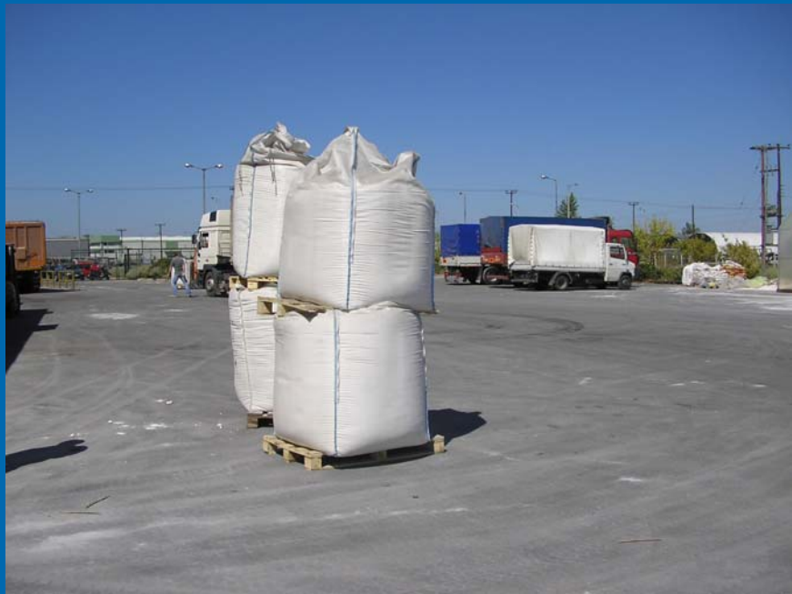
• Allatini Processing and Marketing plant for wheat flour, pasta and baked goods -Thessaloniki