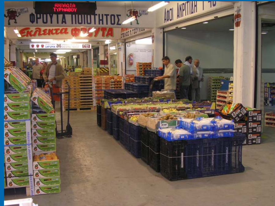
• Central Fresh Market, Thessaloniki