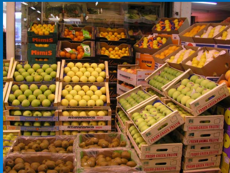
• Fresh fruits-some of them produced in Greece, most of them imported