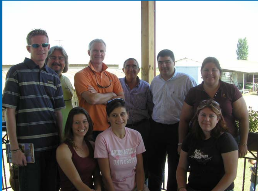
•The ASU team and the Kravvas Farm owners