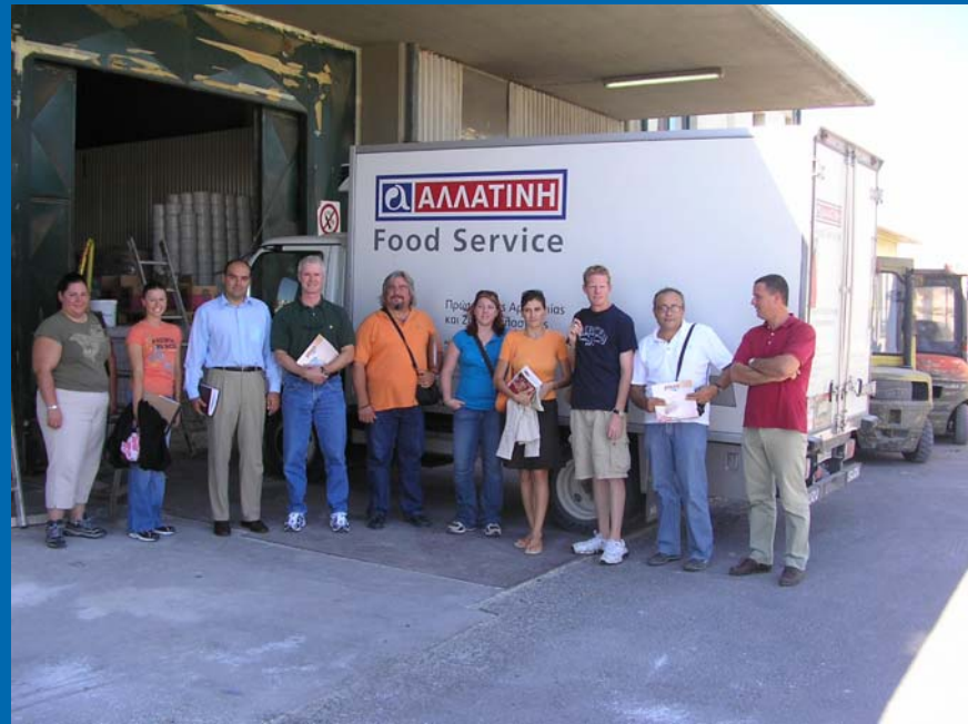
•The ASU team, the AFS scholars and the Allatini's representatives